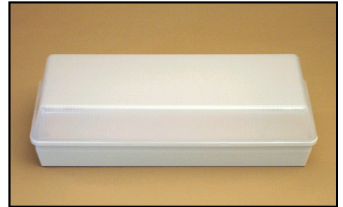
Surface Mounted Fittings