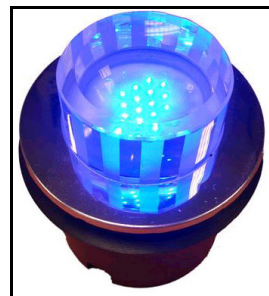
Circular – 14 Unit LED