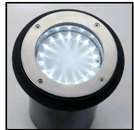
IP67 – 18 Unit LED