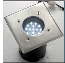
IP67 – 15 Unit LED