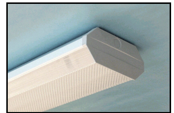
The Norlight Classic Twin